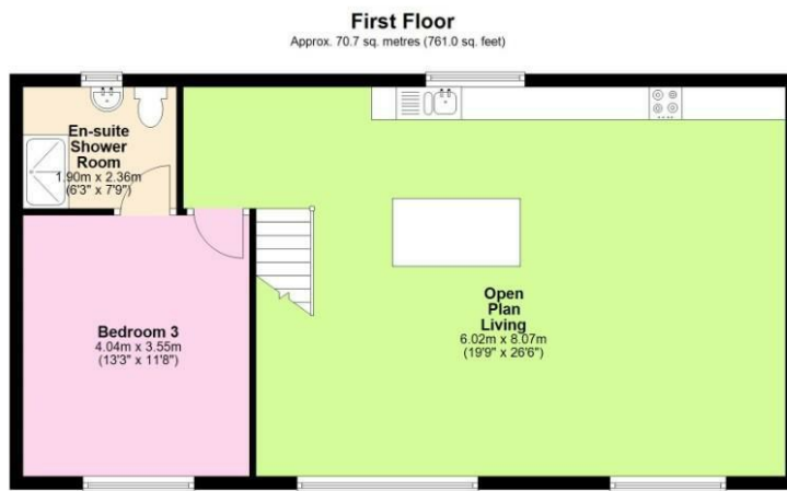
Total area: approx. 138.7 sq. metres (1492.5 sq. feet) Plot 1, The Paddocks